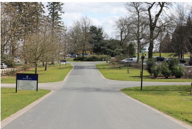
Tarmac Driveway with Clear Signage