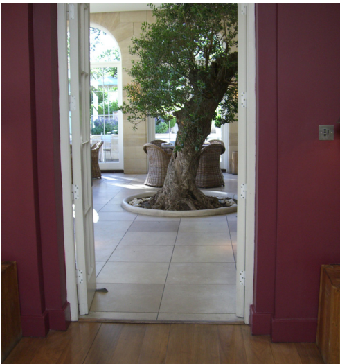
Level Access to Conservatory