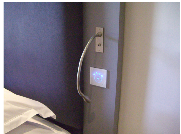
Flexible Lighting and Illuminated Lighting Console