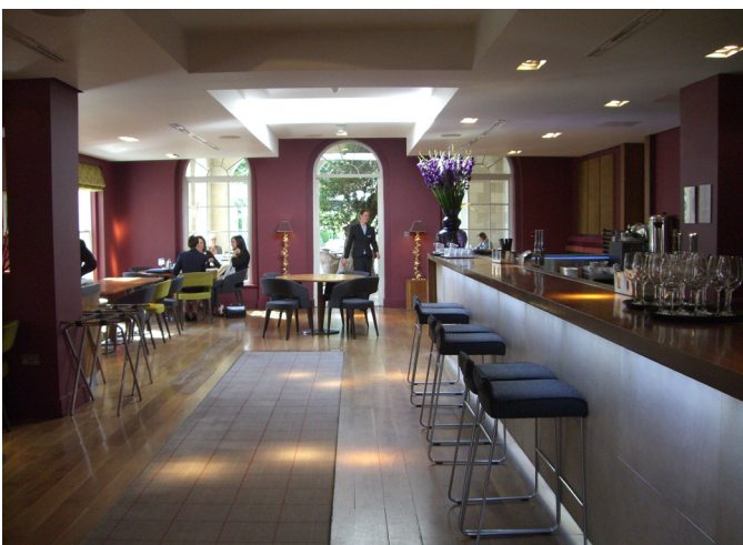
Level Access Through Bar