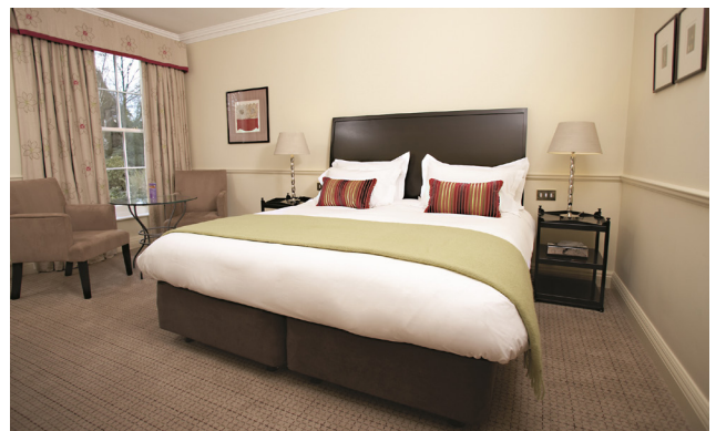
Spacious Ribston Wing Room