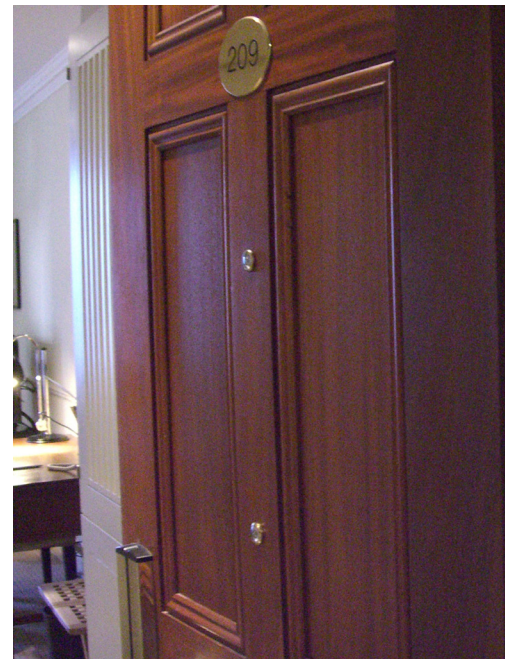
Dual Level Spy Holes