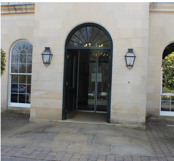
Reception entrance with gentle ramp