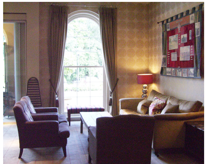
Large Floor to Ceiling Windows in Reception