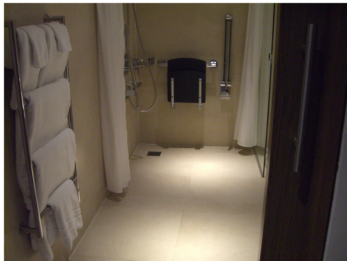
Sliding Door to Accessible Wet Room