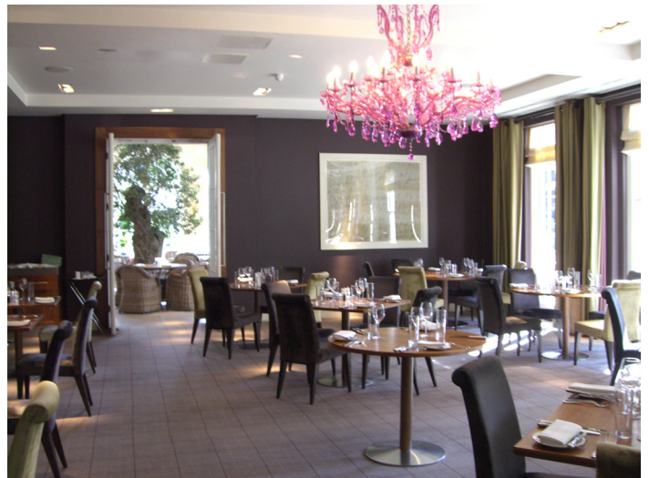
Level Access Through to Restaurant