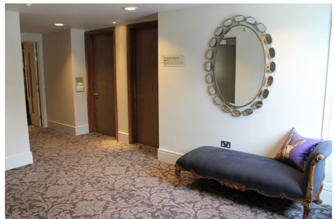
Wide corridors with Seating