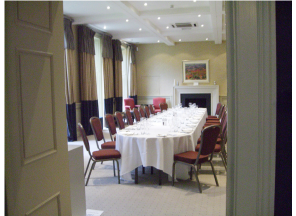
Well Lit Conference Room