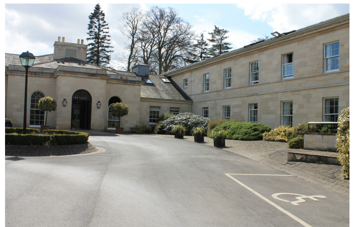
Blue Badge Parking Close to Reception