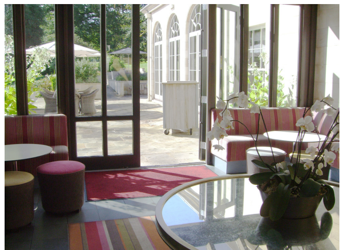
Level Access to Terrace