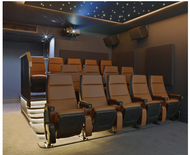
Cinema – 5 Seats with Level Access