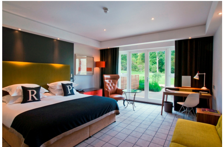
Standard Follifoot Wing Room with Terrace