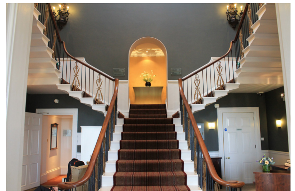
Well Lit Staircase