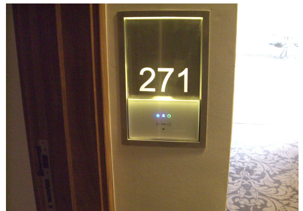
Large Illuminated Door Number