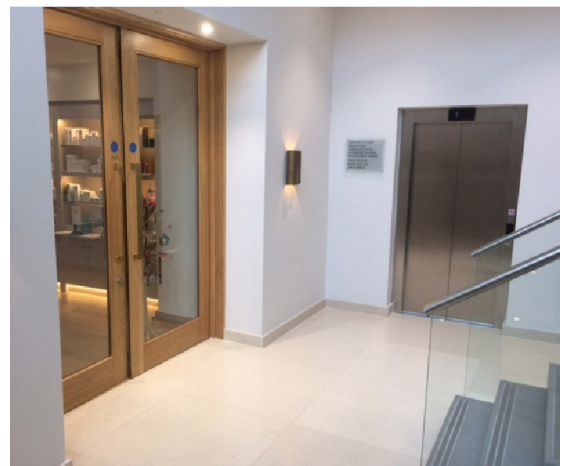
Doors to Treatment Reception