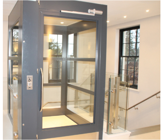
The Link Lift