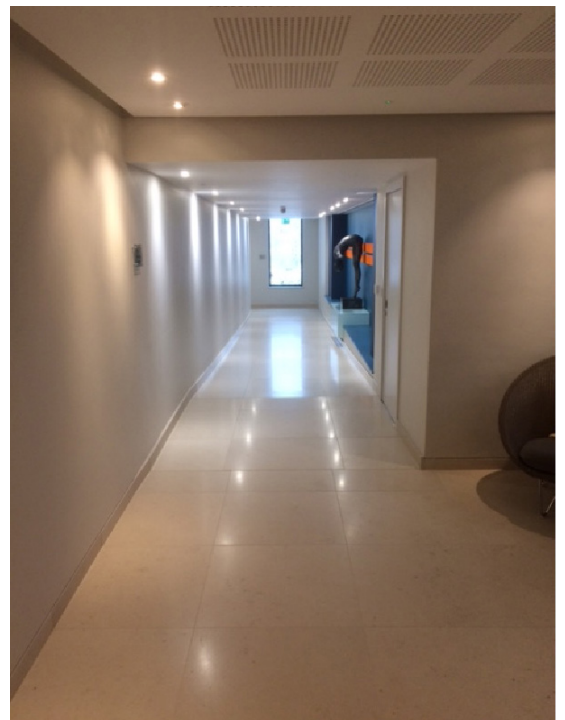
Gentle slope linking two buildings