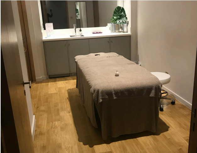
Accessible/Adapted Treatment Room