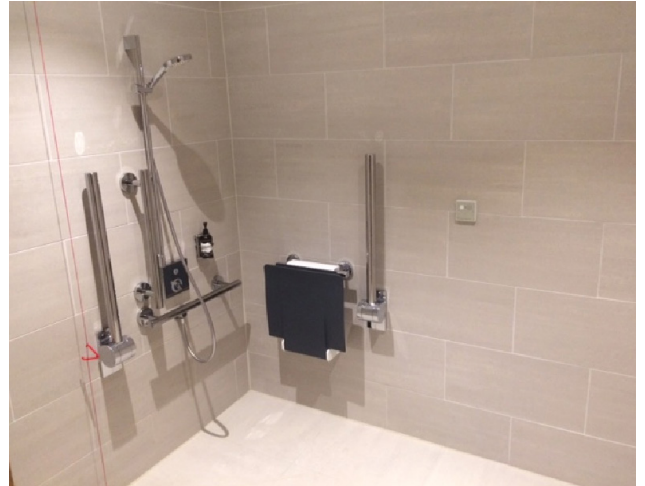
Accessible/Adapted Changing Room