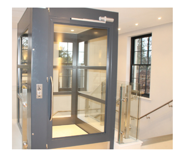
The Link Lift