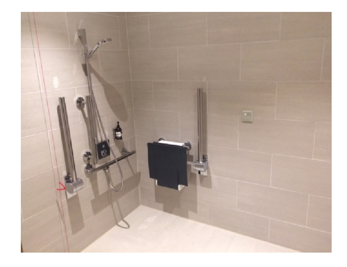
Accessible/Adapted Treatment Room