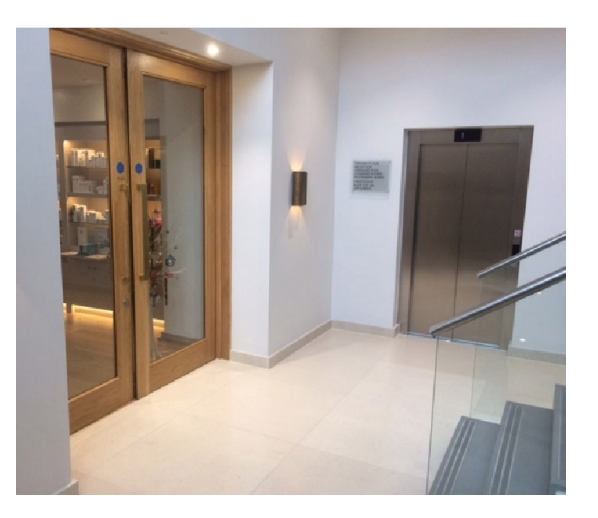
Doors to Treatment Reception