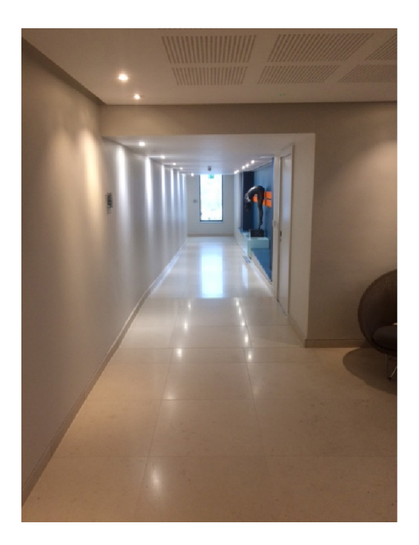
Gentle slope linking two buildings